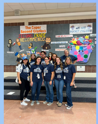
Indian River Pre-K Staff