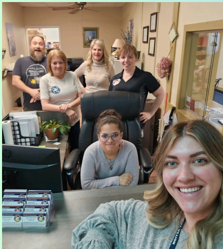
FAMILY CENTER STAFF

104,250 meals were provided to 6950 individuals both on-site and through our Mobile Food Pantry locations, including two sites at Fort Drum