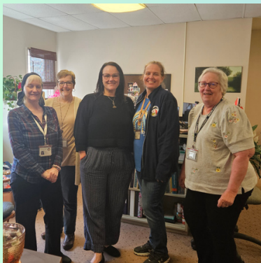
Head Start Administration Staff