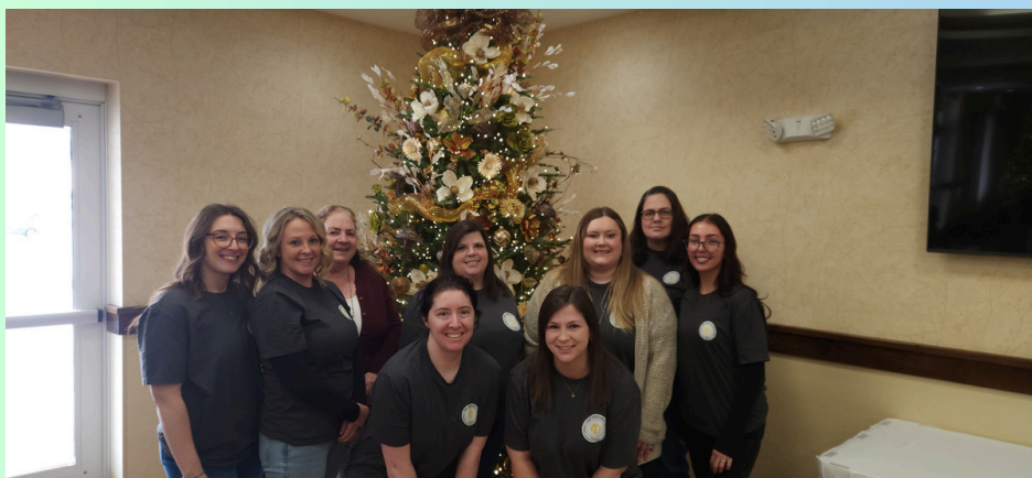
CHILD CARE RESOURCE CENTER STAFF

289 childcare providers participated in training offered by Provider Services staff in 2023.