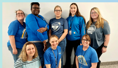
North Jeff Head Start Staff