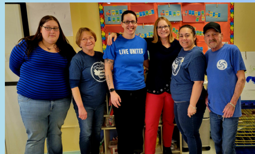
Carthage Head Start Staff