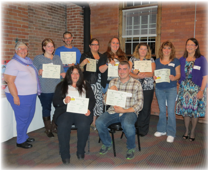
Head Start Policy Council recognition during Annual Dinner, October 28, 2014.